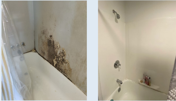
Moldy Bathroom Surround Replaced

First published in the Journal of Allergy and Clinical Immunology, Vol. 148, pages 1121-1129 (2021)